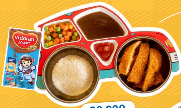
Paket Kids A