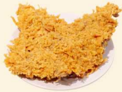
Topping Chicken 10.909