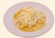
Stripe Cheese 3.636