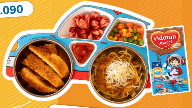
Paket Kids B